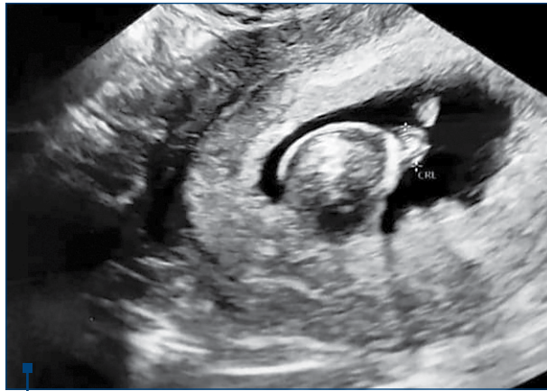
Figure 2. Second ultrasound examination, two weeks later. The embryo is visible within the gestational sac and the chorionic bump has not changed its sonographic appearance