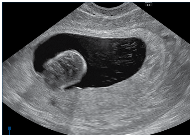
Figure 3. Typical ultrasound aspect of the chorionic bump as a bulge from the choriodecidual surface into the gestational sac