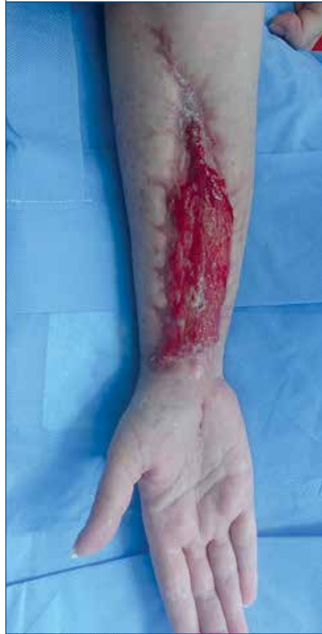
Two months postoperatively