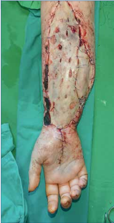
At the end of the last surgical intervention