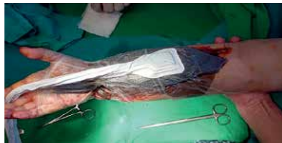
Figure 1. The patient developed a large hematoma at the level of an arterial puncture site complicated with forearm compartment syndrome. Multiple fasciotomies were performed (intraoperative aspects)